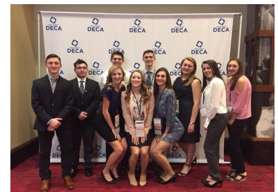
DECA Students in Atlantic City