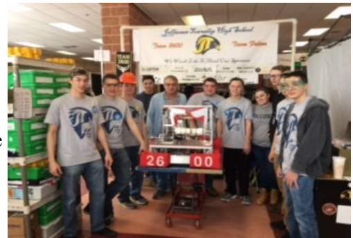
Robotics Team Falcon 2600