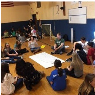
PDP Leaders Visit 8th Graders to Talk about Success in High School