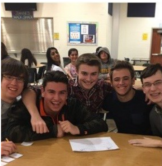
Class of 2019 Trivia Night